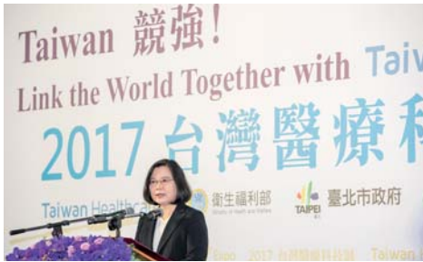
President Ing-Wen Tsai

◆ The inaugural Taiwan Healthcare+ Expo showcasing the entire health industry attracts government support!